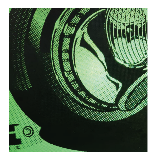
SCREENMAKER CTS Halftone Image at 55 lpi

Contact us to find out more about the SCREENMAKER Computer to Screen System.